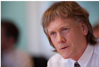
David Thomson Chairman of Thomson Reuters