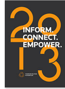
2013 Thomson Reuters Foundation Annual Report (PDF 6.4MB)

2013 was also a banner year for The Thomson Reuters Foundation, a not-for-profit organization supported by our company, which leverages skills and expertise across our organization to increase trust in and access to the rule of law, saving lives through the provision of trusted information and improving standards of journalism. We encourage you to read about the Foundation's work in its annual report and on its website, www.trust.org .